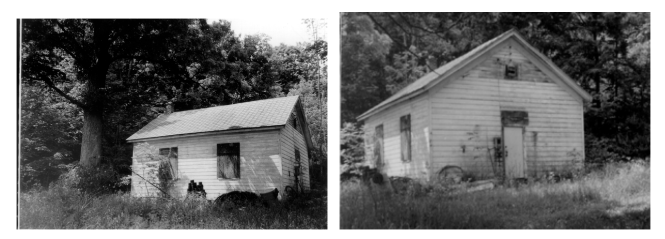
The Owlsville School as it appeared before restoration.